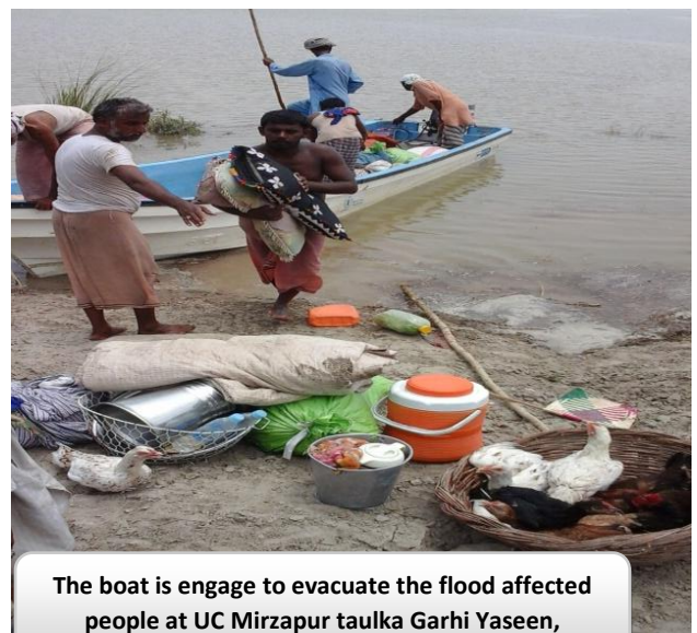
The boat is engage to evacuate the flood affected people at UC Mirzapur taulka Garhi Yaseen,